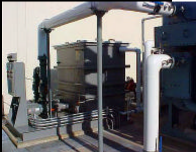
Complete integration with ancillary equipment