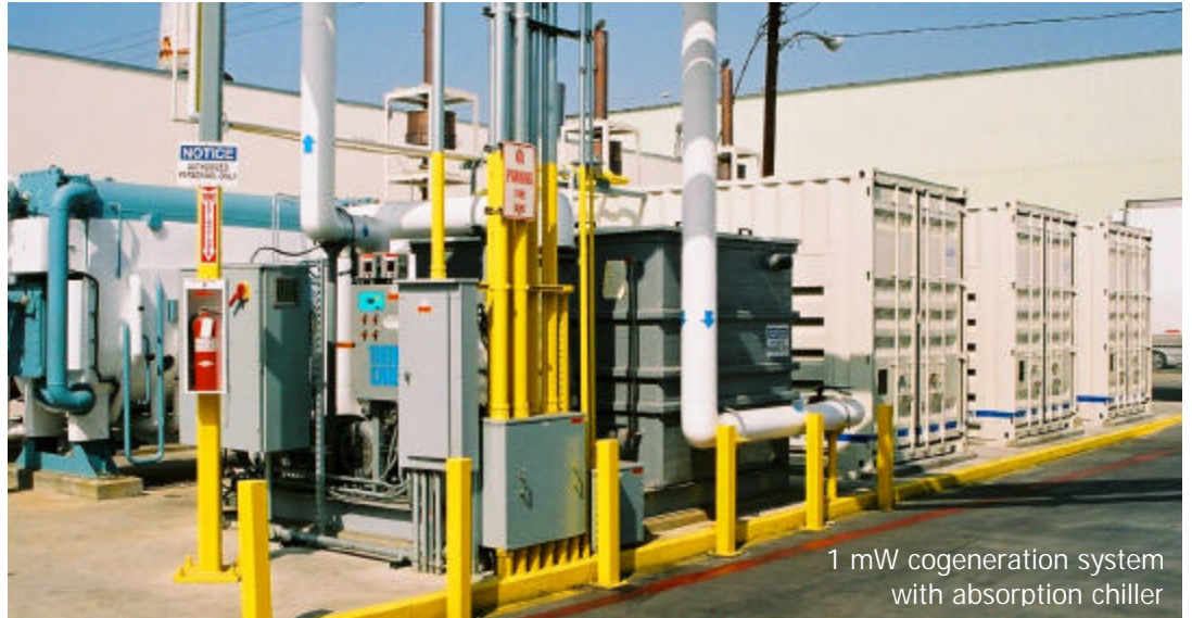
1 mW cogeneration system with absorption chiller

Gammill Electric is a highly qualified supplier of 250 kW to 5 mW CHP (combined heat and power) cogeneration systems, providing a full range of equipment and technical support services to ensure maximum economy and reliability.